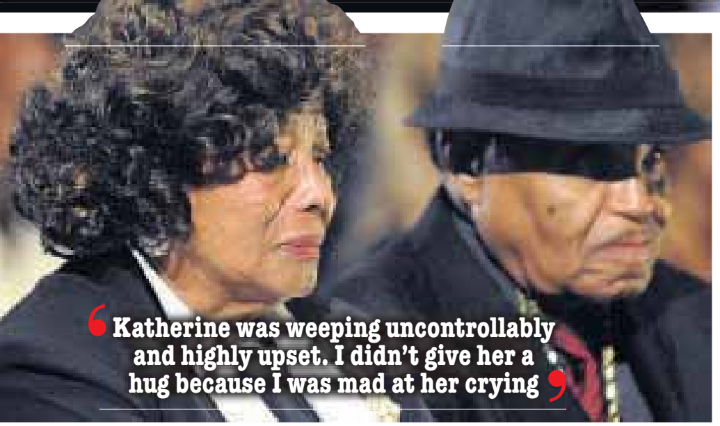
CONFRONTATION: Furious Joe told crying Katherine she could have saved their superstar son

Get your copy only with the NEWS OF THE WORLD