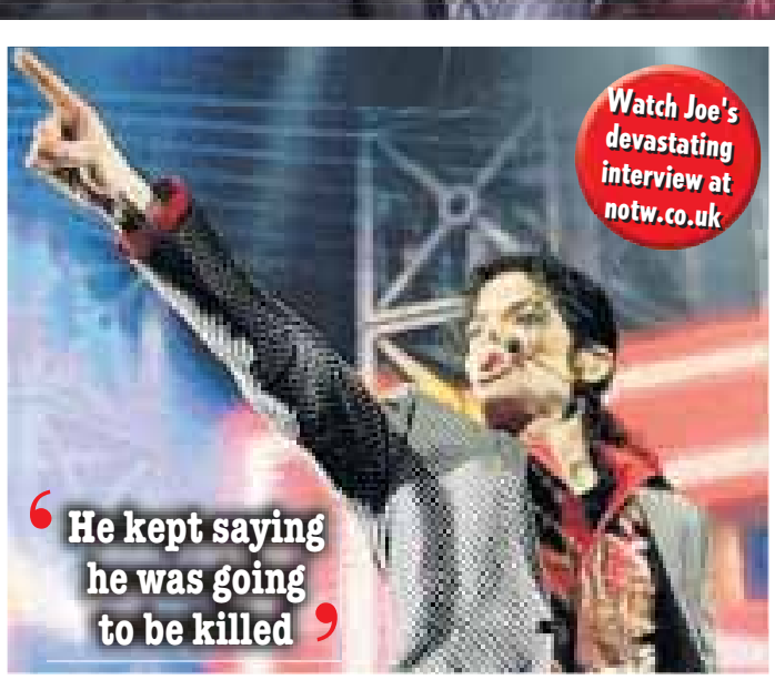
PARANOID: Jackson was afraid he would be shot on stage

I never thought he'd die." Just after midday on June 25 last year, Joe took a call at his Las Vegas home as he watched the TV news. "It was a fan who told me Michael was being carried out of the house on a stretcher. Then it came on the news saying that he had a heart attack," says Joe. "I knew I needed to get to L.A. But on the way I found out by phone from La Toya he had passed in the car. I felt numb and unreal." Devastated Joe headed to the Jackson family compound in Encino as other members said their final good-byes to the King Of Pop in the emergency room of the UCLA hospital in